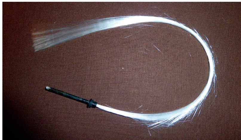
Figure 2: A bundle of early optical fibres each narrower than a human hair.

anaesthesia necessitating the use of general anaesthesia. It could be difficult to manoeuvre the rigid scope through the serpentine anatomy of the male urethra, especially in the situation of frozen pelvis or post radiotherapy and half of diagnostic rigid cystoscopies were negative.