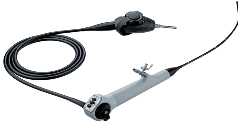
Figure 1: A modern flexible cystoscope (© KARL STORZ – Endoskope, Germany).

Rigid cystoscopy for diagnosis had its problems; the procedure was very uncomfortable if performed under local