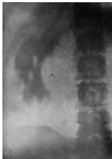
Figure 2: Fenwick's illustration of 'rule 14' showing a large branched and rayed phosphatic stone, i.e. a staghorn calculus.