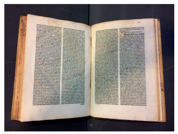
Figure 2: Description of lithotomy in John of Gaddesden's Rosa Anglica practica medicine a capite ad pedes, 1492.