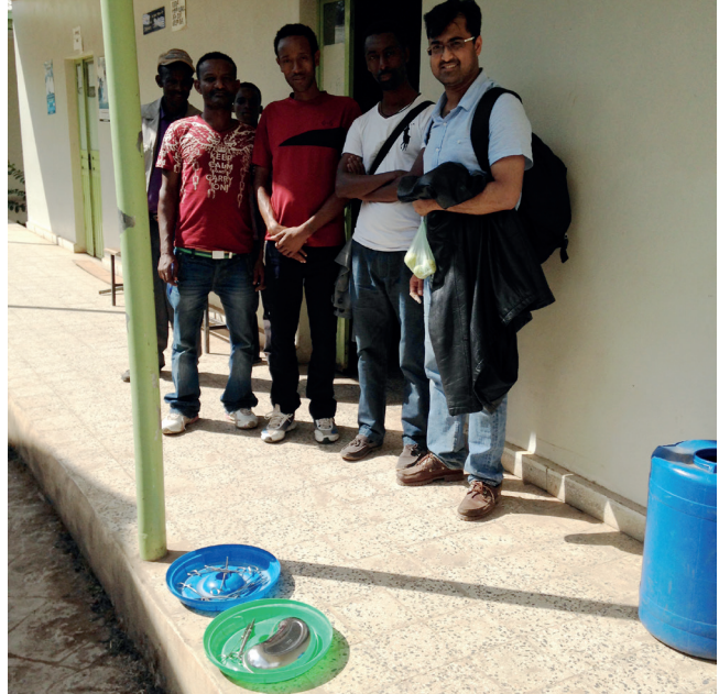
Dedicated time of community health workers